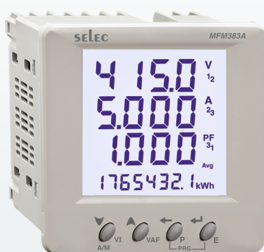
96 x 96mm