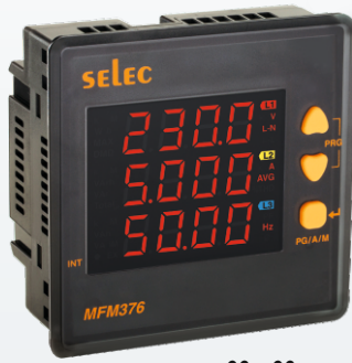
96 x 96mm