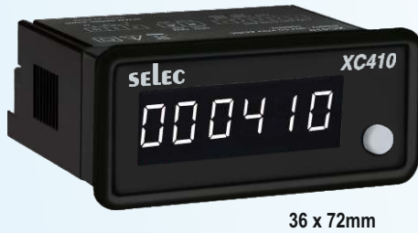
36 x 72mm